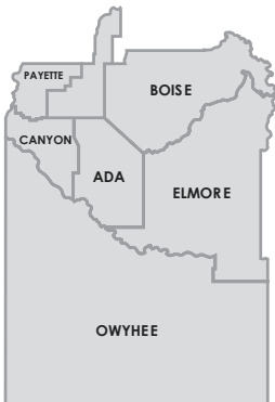
SOUTHWESTERN IDAHO SHARED workshops@persi.idaho.gov 208.287.9291

For individual retirement questions, please call 1-800-451-8228. P.O. BOX 83720 Boise, Idaho 83720 | www.persi.idaho.gov